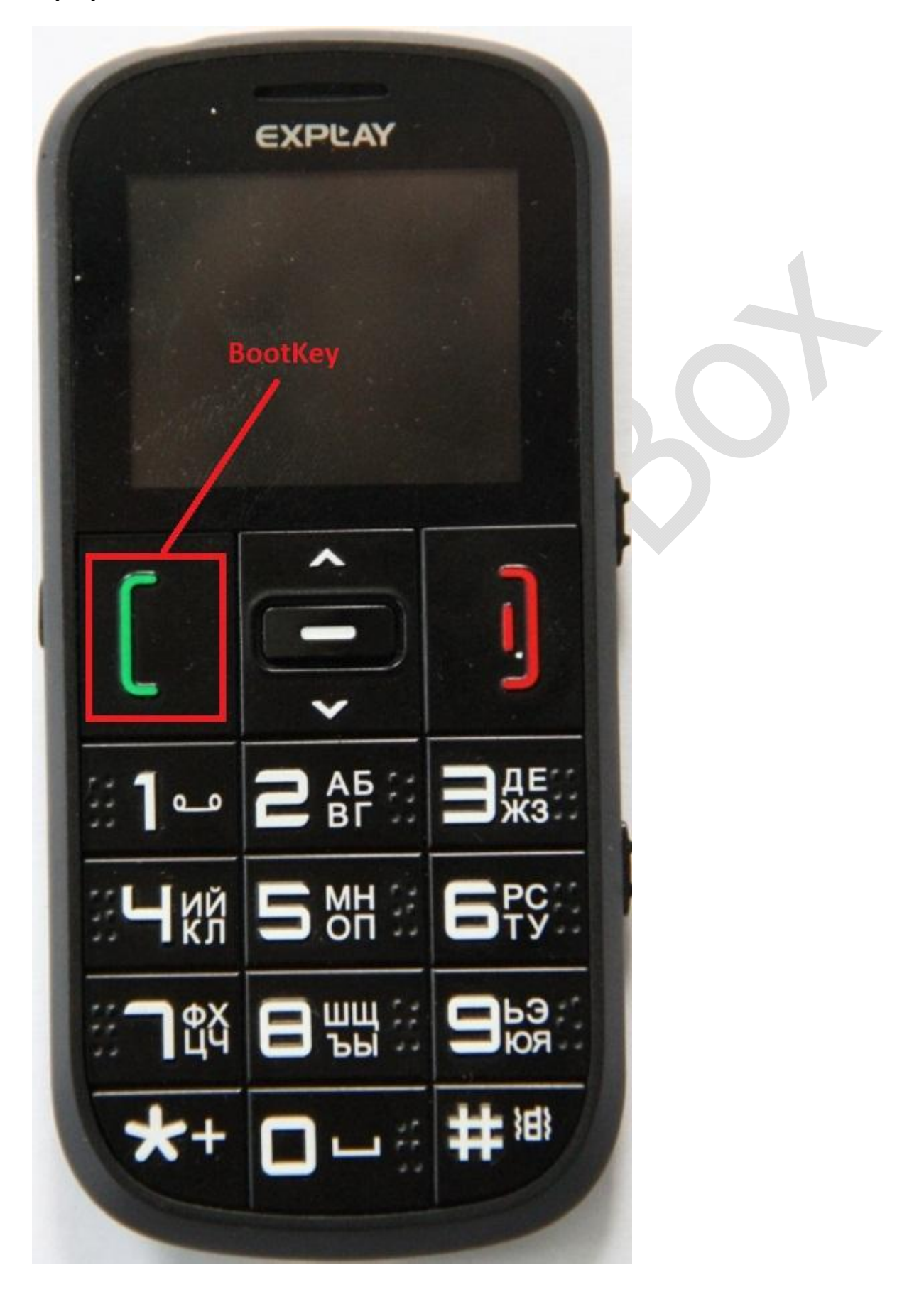
How connect : Follow reference on Page 1.