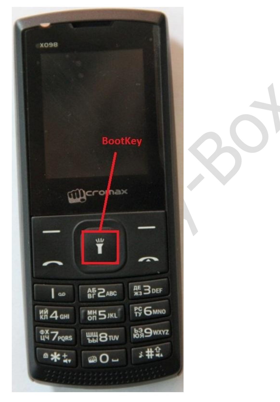
How connect : Follow reference on Page 1.